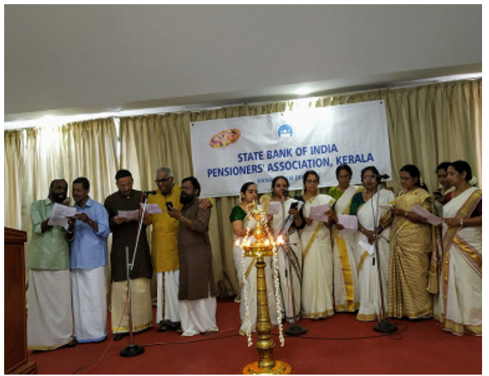
Ponnona Pattukal by Team Palarivattom

Members belonging to Ernakulam District Unit who have not yet received the Directory are requested to contact the Area/District office bearers urgently. The same is also available at the District Office, at D-9, Penta Estate, 2nd Floor, South Janata Junction, (Near Metro Pillar No. 542), Palarivattom.